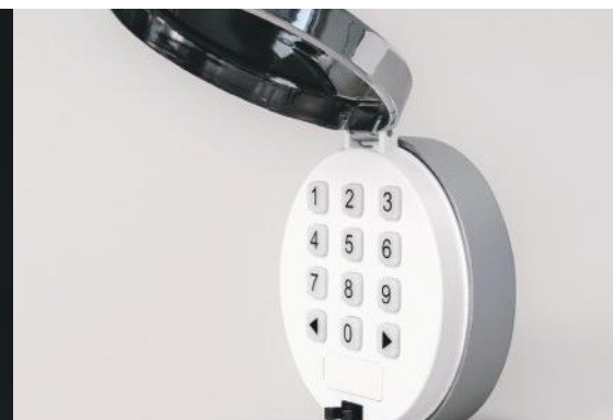
2-channel TP11 wall-mounted remote control