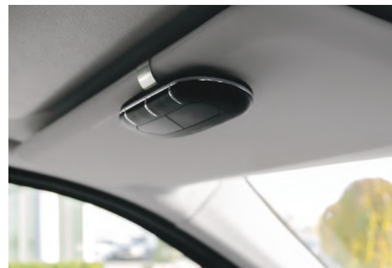
2-channel TP05 car remote control