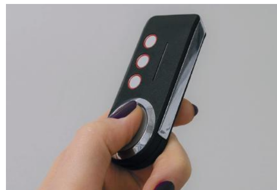
3-channel TP02 key ring remote control with status feedback

A remote control with a keyboard allows you to open the gate with your individual code. This solution will allow you to program the drive with a code known only to you and your loved ones.