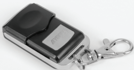
Single-channel SKIDA YSH key-ring remote control (SKIDA_1Rk YSH)

1. Control: can control single motor, or a group of up to 20 motors