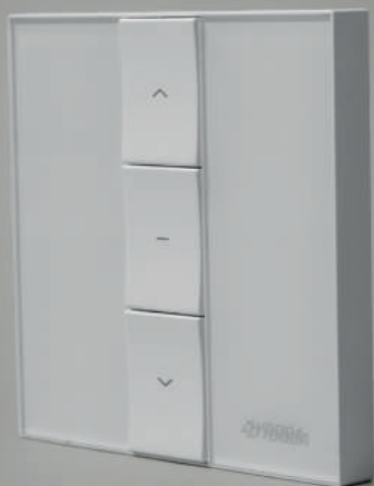
Single-channel NUXO wall-mounted remote control, (NUXO_1Rw)